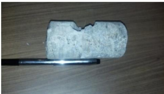
CORE SAMPLE (click to enlarge)

The area is prospective for hydrothermally dolomitized and/or naturally fractured conventional plays in the Val-Brillant Formation sandstones and the Sayabec, Forillon and Indian Cove formations limestones. A series of shallow wells drilled for gold in the early 2000ies have confirmed the presence of light oil and gas in the area and hydrothermally dolomitized Sayabec Formation showing high porosity with large vugs and pyrobitumen (degraded oil) was recently documented on outcrop north of the Properties. Governmental and proprietary seismic lines have been reprocessed and reinterpreted in 2015 and have highlighted several deep and shallow drilling targets in both properties