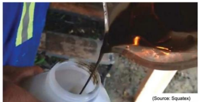
Dark brown (D8) oil with 19.85 API and less than 1% sulfur. Sample collected at surface (Massé No 2)