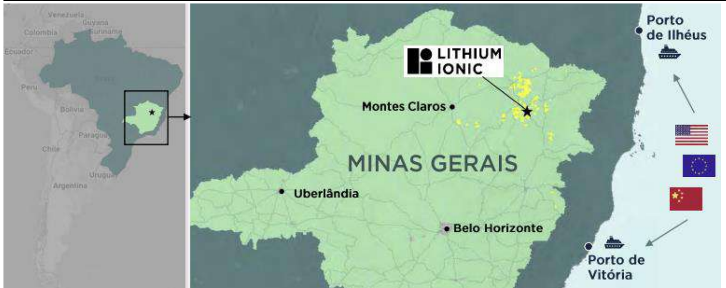
Figure 1: LTH's portfolio location in Minas Gerais, Brazil