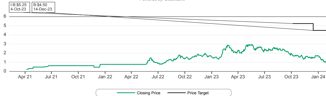
Chart legend: TP: Top Pick, B: Buy, H: Hold, S: Sell, NR: Not Rated, I: Company initiation, T: Transfer of coverage, S: Coverage suspended, DC: Coverage dropped

Full disclosures for research of all companies covered by Desjardins Capital Markets can be viewed at https://desjardins.bluematrix.com/sellside/Disclosures.action .